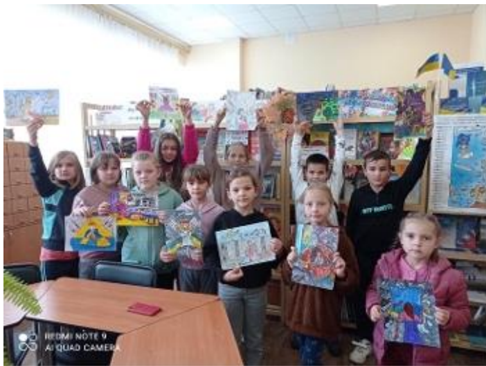
“Children Draw War not Flowers” drawing contest, Cherkasy Regional Library.